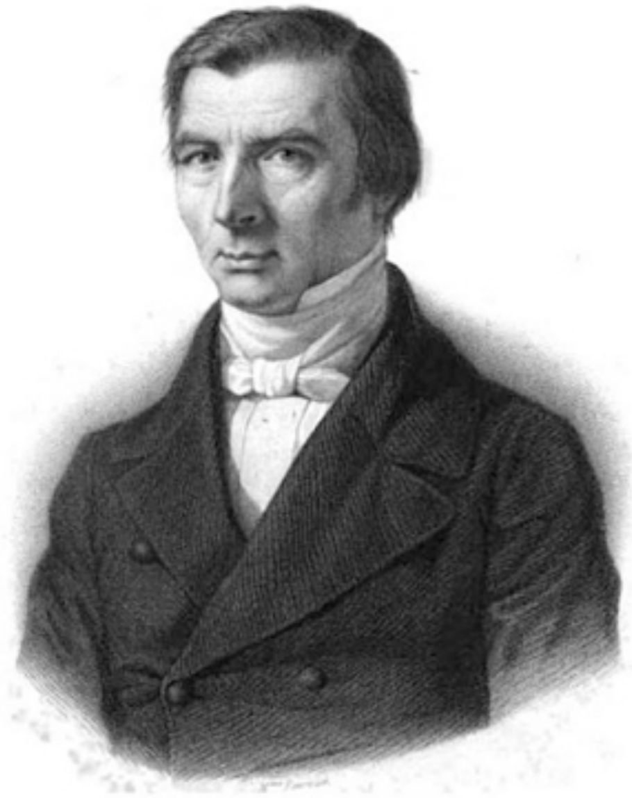
Frédéric Bastiat (1801-1850)