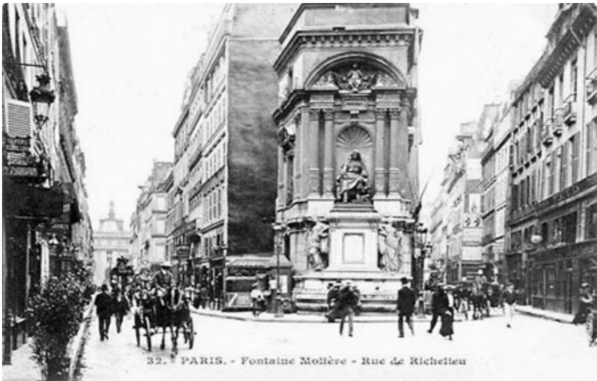
Illustration: rue de Richelieu and the Molière Fountain

The rue de Richelieu in Paris where the Guillaumin publishing firm had its headquarters (left fork). It is also where the Political Economy Society met. A statue of Molière and a fountain can be seen in the centre.